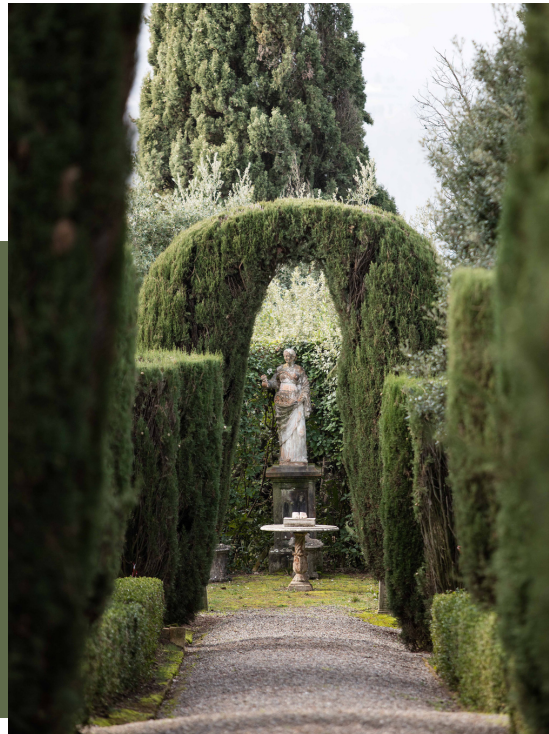
Pomona, Goddess of the fruit of the earth

Here are the three sacred plants of the Jewish, Christian and Muslim tradition: Seth, Adam's third son after Cain and Abel, put three seeds in his dead father's mouth. Three sacred plants were born from the seeds: the cypress, the olive tree and the cedar of Lebanon.