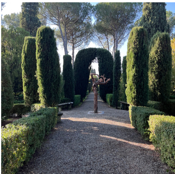
Mirra and the birth of Adone